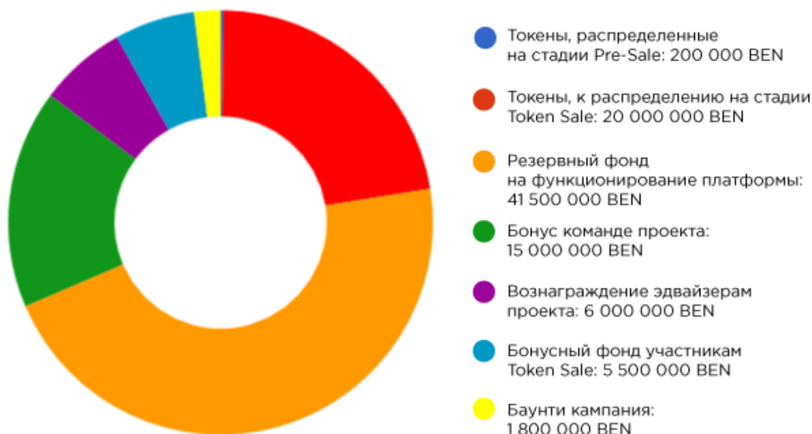
Распределение токенов Bitcoen